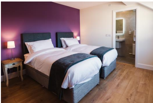
Twin bedroom (optional double)