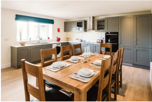
The Barn House Kitchen

Ballynoe House is the newest self-catering project in West Cork providing a unique blend of flexible, luxury self-catering accommodation for individual families, larger family groups, friends and couples, set in a tranquil, rural & coastal environment.