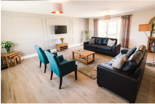
The Barn House Sitting Room