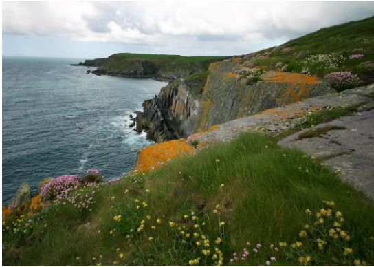
Cliff-top meadows at Keameen Point