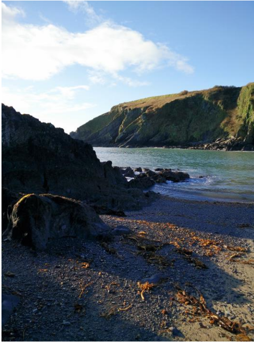
Sandscope, one of our local beaches

Ballynoe House is the newest self-catering project in West Cork providing a unique blend of flexible, luxury self-catering accommodation for individual families, larger family groups, friends and couples, set in a tranquil, rural & coastal environment.